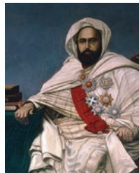
Emir ABD EL-KADER