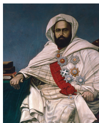
Emir ABD EL-KADER